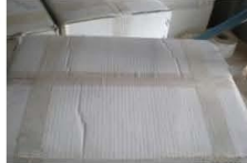
Packing of export cartons