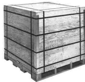
Signode steel strapping and plywood can be combined to fabricate 300 gal. (1140 l) storage containers used to store and ship a myriad of industrial products.

Zinc finish strapping is waxed and has a zinc enriched coating to provide outstanding resistance to rust. Available in a variety of Apex and Magnus sizes, it has the same improved tension transmission characteristics as the painted and waxed strapping. Zinc finish protects where it is needed most—at points of surface damage and scratches.