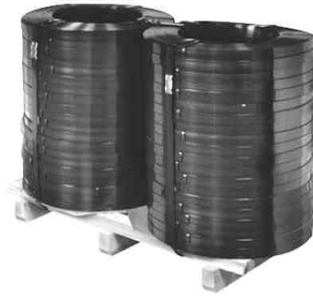
Ribbon wound skid