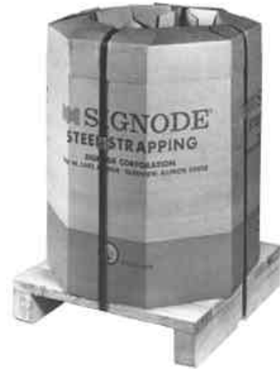
Mill wound skid

1-1/4" x 0.031" (31.75 x 0.8 mm) painted and waxed Magnus is available in a 220kg coil. Other Apex or Magnus sizes can be produced in 200kg or larger coils on a special manufacture basis. Contact your Signode sales representative for details.